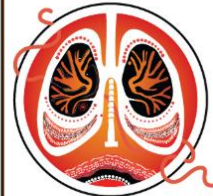
Tackling Indigenous Smoking