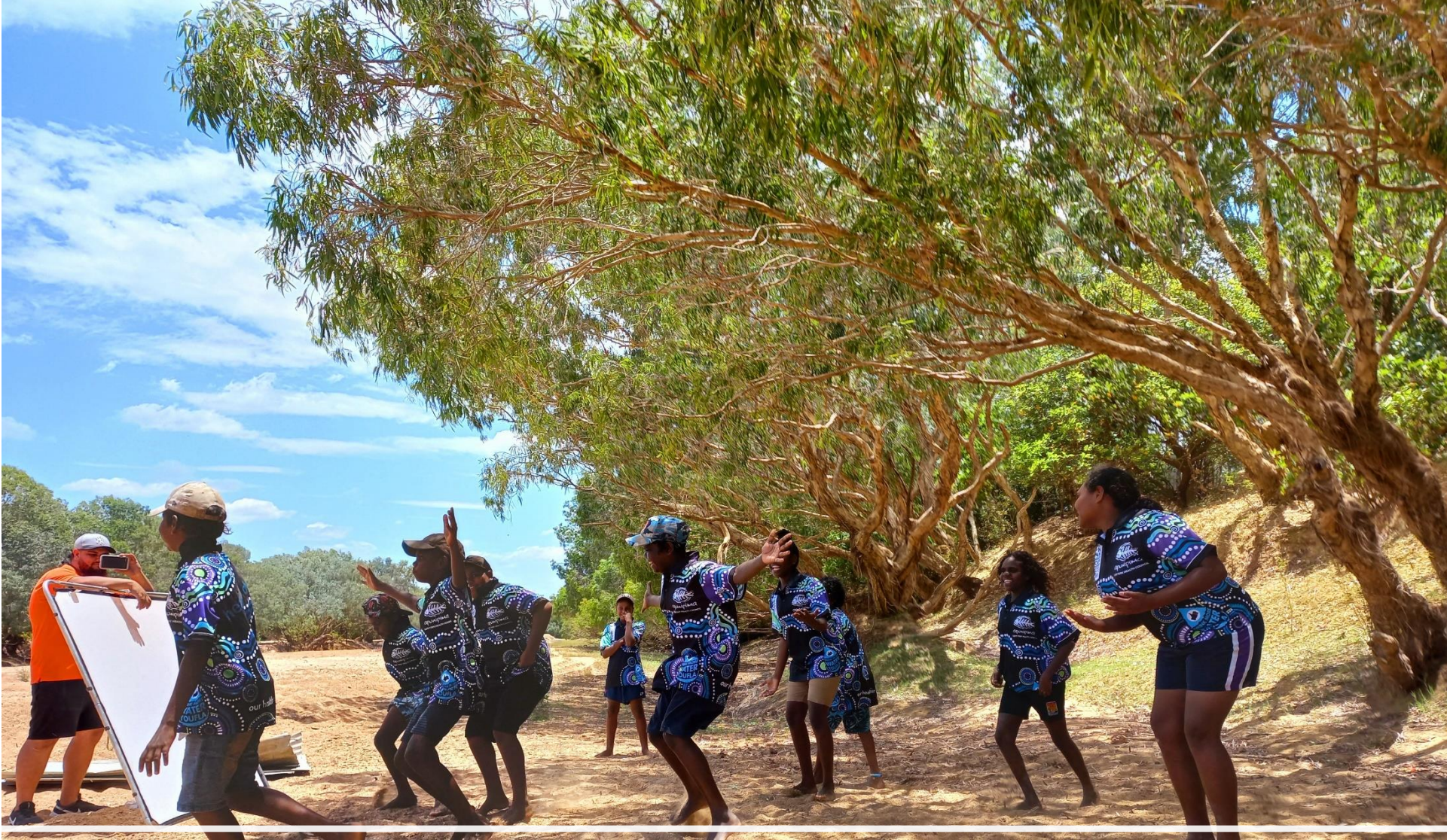
Apunipima Cape York Health Council Tackling Indigenous Smoking Team